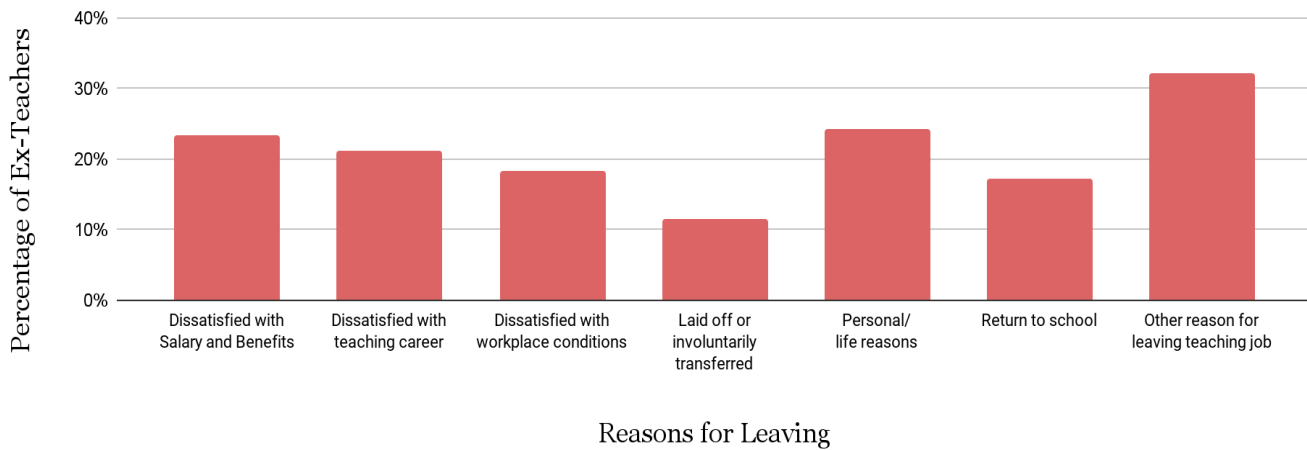
Figure 1: Why teachers are leaving the education system separated by reason for leaving and the percentage of teachers that chose each option, sometimes choosing more than one option.